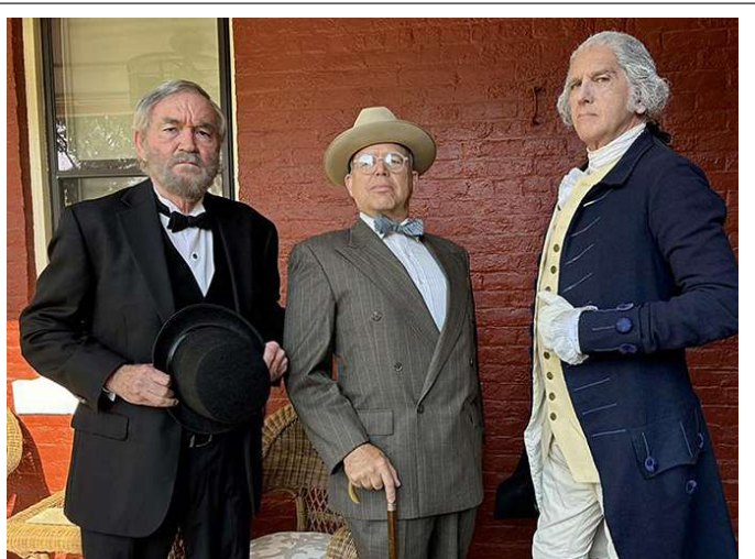
Constitution Day 2024 was held in Huntington County for all fifth grade students on Monday, September 16 at Huntington North High School. The community was then invited to the Merrillate Centre for the Arts, Zurcher Auditorium, Huntington University for the community event. Shown in the photo above are reenactors from left to include Presidents Ulysses S. Grant, Harry S. Truman and George Washington.