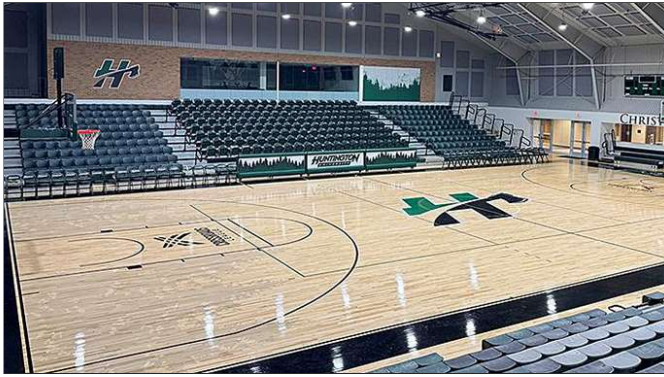
Shown in the photo above is the new Platt arena inside the Huntington University PLEX.