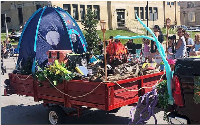
The Huntington City-Township Public Library's float, "Adventure Begins at Your Library," received first place in the Best Youth Group category in this year's parade.